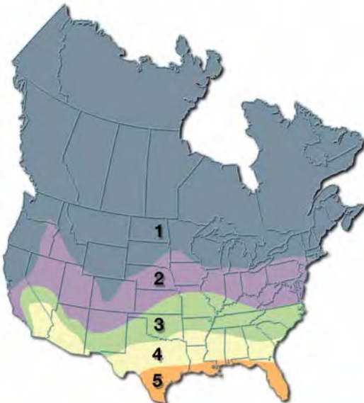
Approximate Annual Cooling Operating Costs